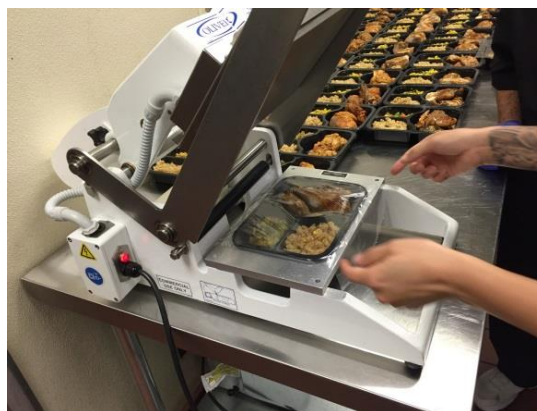
Using the new equipment, a Project Launch student prepares meals with Project Reclaim food for distribution as part of Project Nourish.